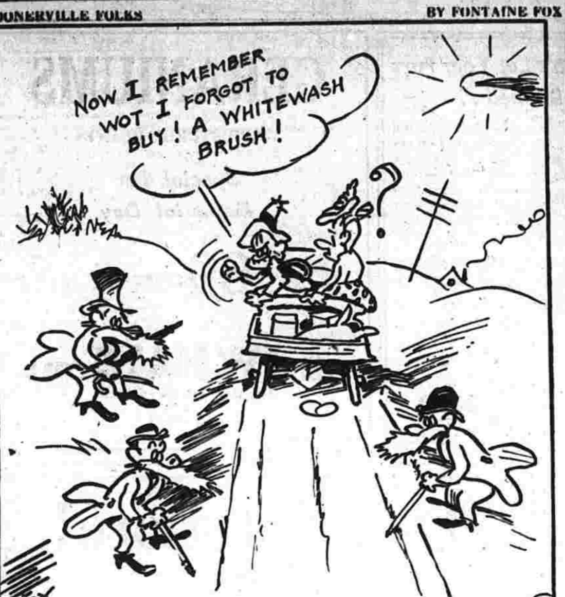
Now I Remember Not I Forgot to Buy a Whitewash Brush!

Flourish - Nurseries 15 TRANSPLANTED Plants - Vegetables, tomatoes, peppers, lettuce, cucumbers.